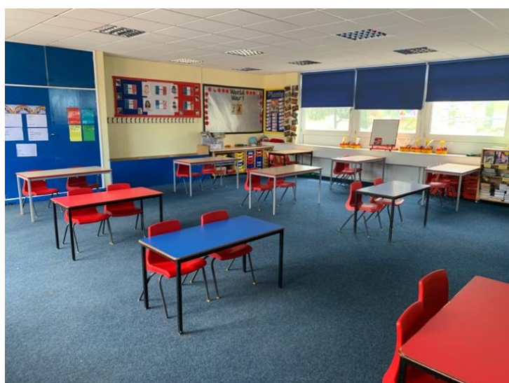
Year One Classroom