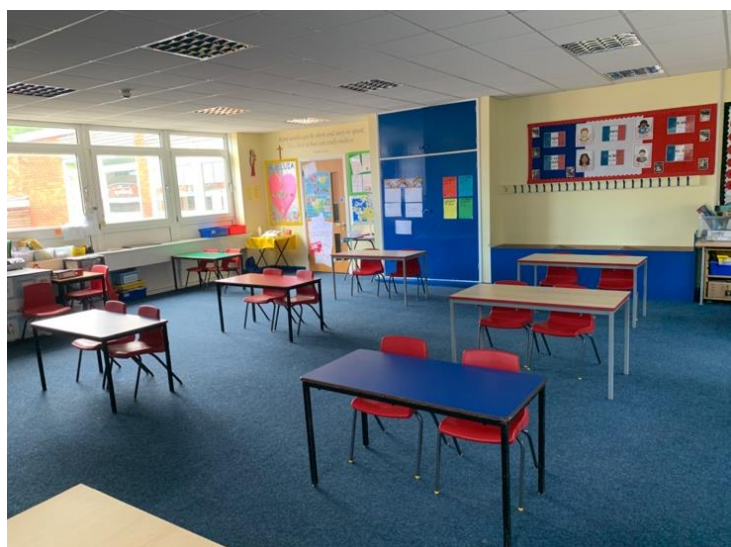
Year One Classroom