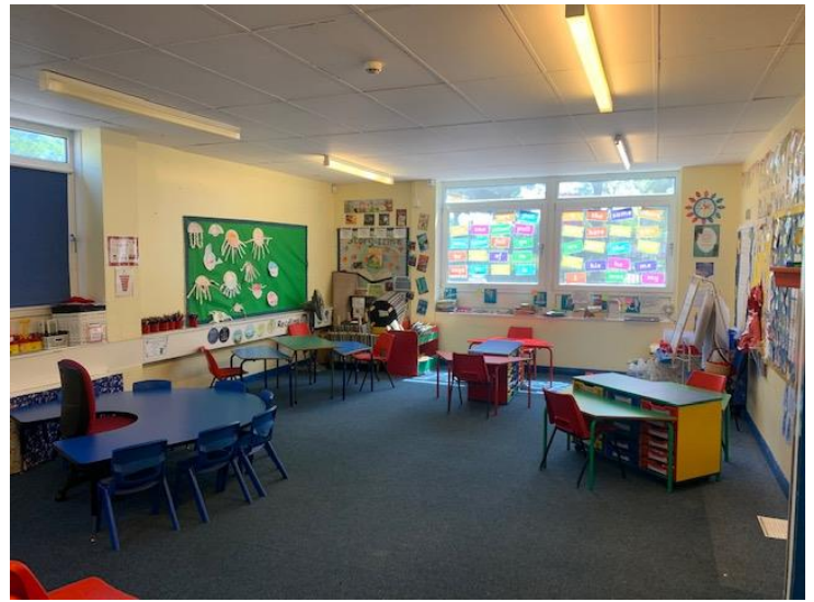
Reception Blue Group Classroom

To make sure we don't spread germs, some toys and resources will be put away because they cannot be kept clean.