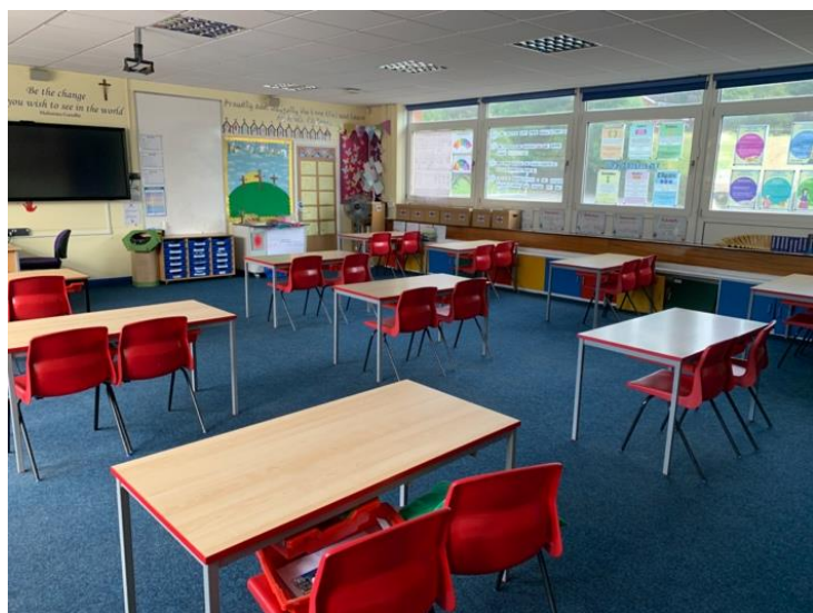
Key Stage 2 Key Worker Green Group

PLEASE NOTE: Once we have reached our capacity for number of children attending school, we will no longer be able to take more children in. Our capacity is 70 children in total in school, as we have 7 classrooms, there will be 10 children in each classroom.