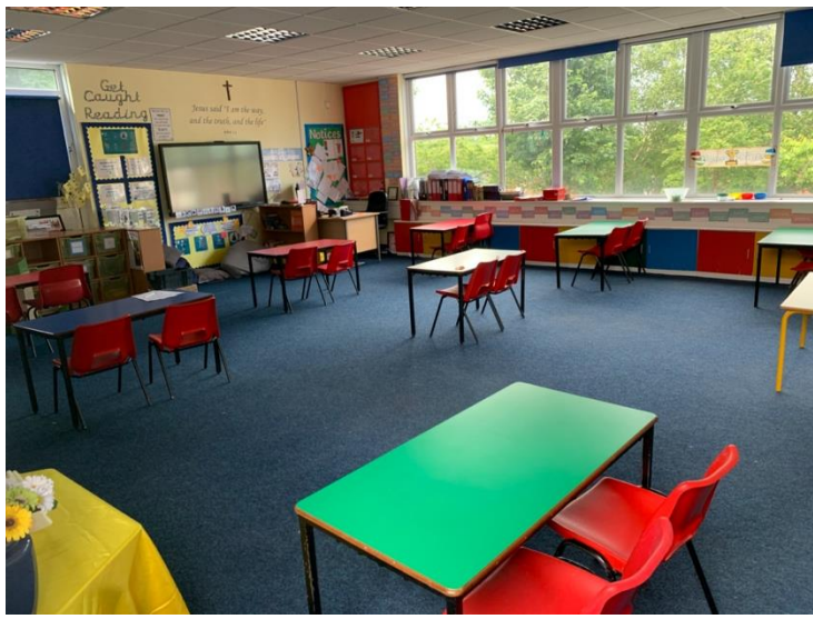
Year One Classroom in preparation for second group.