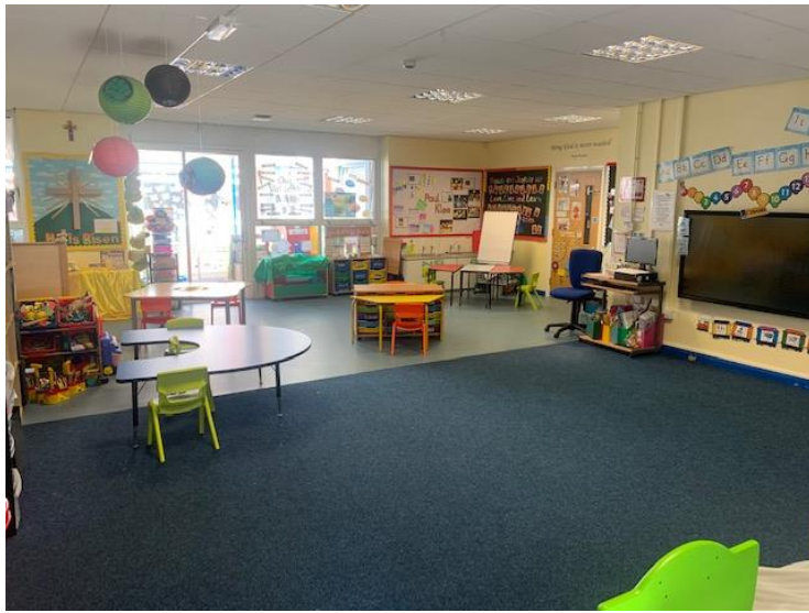
Reception Red Group Classroom